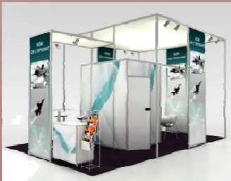
This picture is subject to modifications

* This feature is exclusive to the first two companies to sign up for a platinum option.