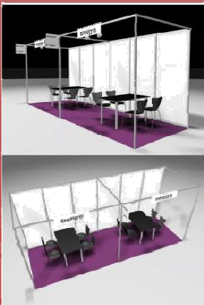
This picture is subject to modifications